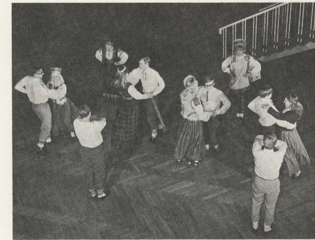
LATVIAN FOLK DANCERS

In 1944 about 150,000 Latvians fled their homeland as the Soviets once again were advancing to occupy Latvia. About 50,000 of these Latvians have found new homes in the United States. The present population of Latvia exceeds two million people.