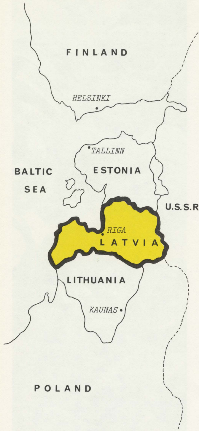
BALTIC COUNTRIES IN 1944