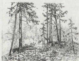
"Woods" (1945) 5" x 6" etching For Sale—$480