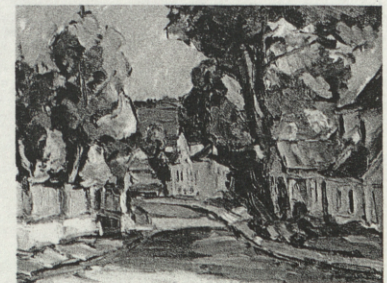
"Street in a Small Town" 14" x 18" oil/canvas For Sale—$2200