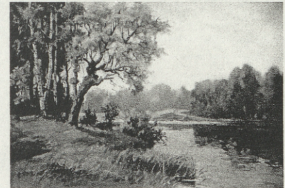
"At the River" (1950) 12" x 17" oil / canvas