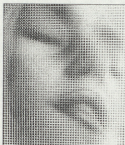
"Erotic Movie" (2003) 22" x 19"