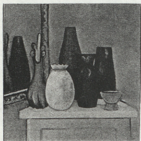
"Still Life" (2003) 24" x 24" oil on canvas For Sale—$300