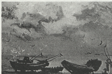
"Fisherman Boats" 14" x 18" oil / board For Sale—$2500