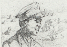
"Swain" (1945) 5" x 7" etching For Sale—$480