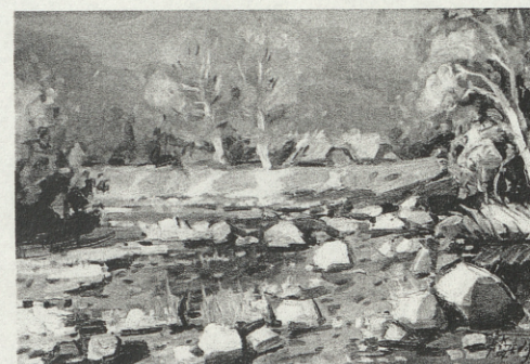
"River" (1970) 12" x 17" oil on board For Sale—$980