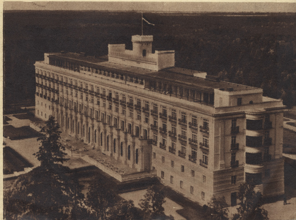
The Ķemeri Hotel.

In the first-class hotels in Riga a room costs from lats 8 to lats 20 without board; and from lats 10 to lats 30 with board.