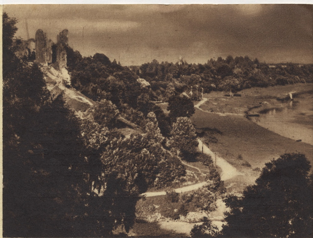
A View of Koknese.

been the age-long tradition to mark every event, from the cradle to the grave, by the singing of these melodies either by the individual or the group. The All-Latvian Song Festival had its beginnings as far back as the last century (the first was in 1873).