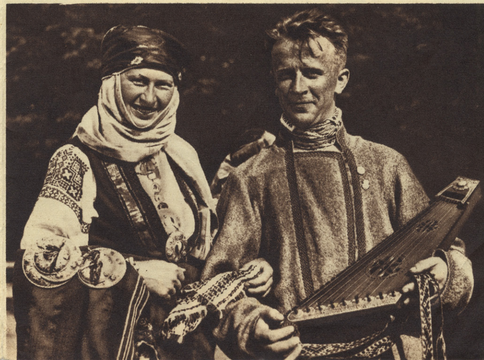
Playing a Latvian Stringed Instrument.

These unique and rich folk-melodies constitute the ground-work of Latvian music and choir-singing, for it has