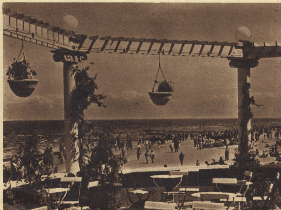
The Riga Seaside Beach.

In the poetry and soul of the Latvians we find vividly envisaged the idea of the universal power of song. Not only does song make life more tolerable, but the spirit of song dispels enmity, while the power of song stays arrows and wards off wars. That is why the people of Latvia, by celebrating their ninth Song Festival in June, hope that the spirit and sound of their song will spread far beyond the boundaries of their own country. May this lively belief of the nation be justified. May song be the bond uniting the culture and art of the nations. May it be the promoter of brotherhood, cooperation, and peace.